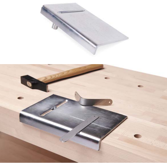
The anvil is intended for work with iron and minor metal machining works, which you can now also do on the joiner's workbench.