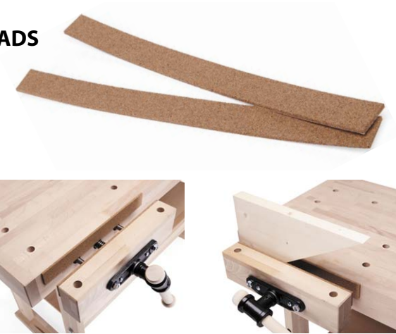
The cork protectors are suitable accessories for protection of machined wooden pieces, as well as for the vice on your joiner's workbench, especially when working on material with a soft surface or that is susceptible to scratching.