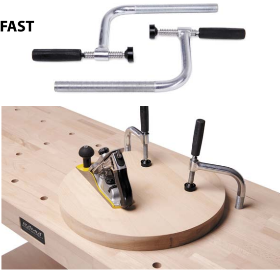
Clamps are used for easy and quick clamping of the material to the worktop.