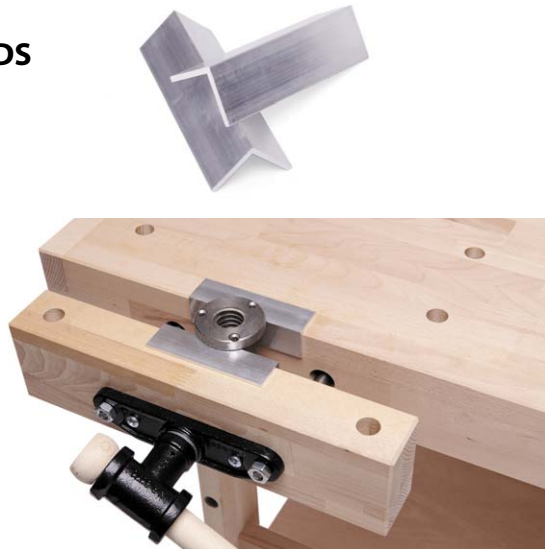
The aluminium protectors are used to protect the vise when working with material that is harder than wood.